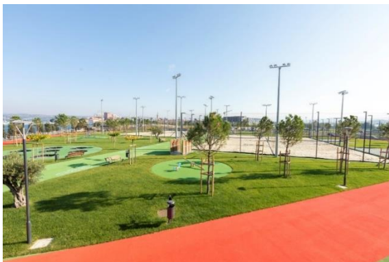
Beach Volleyball Park Koper