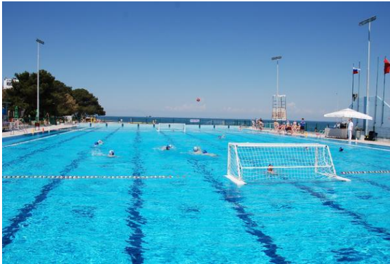
Olympic Swimming Pool Žusterna